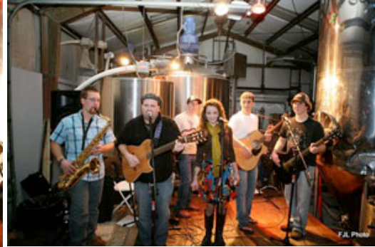
Jack's Waterfall and Friends